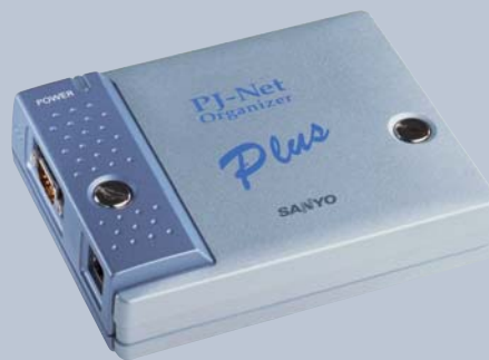
PJ-Net Organizer Plus (POA-PN02)

An additional plus: All of these benefits are also available with wireless, WLAN technology.