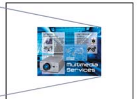
Compressed display (1/4)